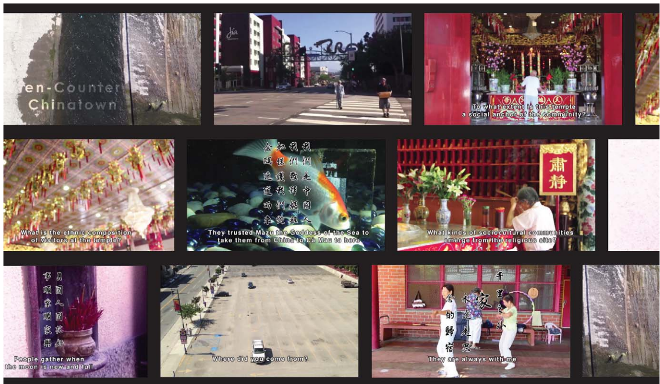
Scenes from Encounter Chinatown.

upon the one we knew. A question like “Who is Chinatown?” which on first blush sounds ridiculous now begins to make some sort of odd sense. Aren’t these the questions that any critically minded scholar first asks of a situation? For whom is this neighborhood meant? And who else is excluded? There is, again, a touch of the supernatural. Between shots of incense and prayers, the video’s rhythm is maintained only through a Buddhist monk’s tolling of the bells. It asks us to slow down, to read between the lines. Is there another Chinatown present, one that we looked past before? This immanent speculation is easy to brush past because it lacks the didactic quality of a futurist’s homily or the spectacle of an opera on wheels, but given time it is perhaps even more effective, more seductive, because we are the ones who are compelled to complete the task of speculation. We are given time and space with which we can attempt to make sense of the swirling assemblage of images before us.