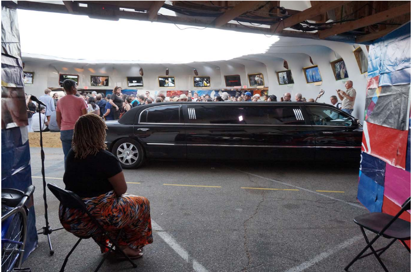
Viewers at Hopscotch's central hub.

and places. It drew from this network, looking past and forward, simultaneously creating and suggesting potential for creation, expanding the margins of the possible.