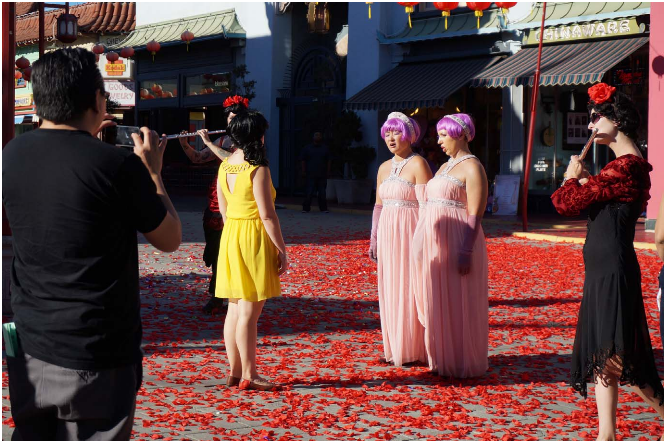
A performance of Hopscotch .

otherworldly fantasy—as it was embedded in the messy reality of urban space. At one point, a homeless person noticed the captive audience and began singing her own tune before a nervous stagehand awkwardly ushered her away to receive her own headset. And, of course, the inversion of who is watching and who is being watched cannot go unstated: as much as we privileged theatergoers invaded this space and tried to watch as much of the frenetic and fractured performance as we could, so too were we being gawked at by passers-by. We were a funny-looking mob of confused people with wireless headsets on, providing our own free show. There was none of the unidirectional comfort of a darkened theater. In this strange, ambivalent way, the audience’s discomfort with being implicated by the performance’s dynamics—of power, of privilege, of post-modern obtuseness—became absorbed into the opera, suggesting an alternative, immanent reality that had the potential to come into being.